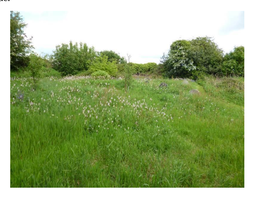
Fig.6: burial ground from the south-west

The burial ground lies to the north-west of the meeting house, enclosed to the north-west by a drystone wall and a fence to the east. There are rows of plain headstones with semi-circular heads. The burial ground has been in use since 1702 (the date when Sunbrick closed). It is still in use and a plan of the burials is kept by the registrar to the meeting. Most of the area is managed for wildlife with wild flowers and long grass, and mowing limited to paths and an area of more recent burials on the west side.