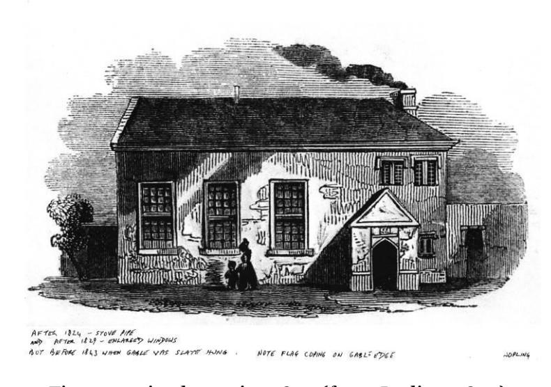
Fig.1: meeting house in c1843 (from Jopling, 1843)