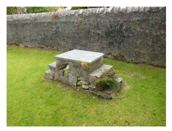
Fig.9: view from the road with former Fig.10: mounting block stable to right

The detached burial ground at Sunbrick is about two miles to the south, at SD2861973913; it is notable as the burial place of Margaret Fell (died 1702), prominent early Quaker and wife of George Fox. The walled enclosure is Grade II listed.