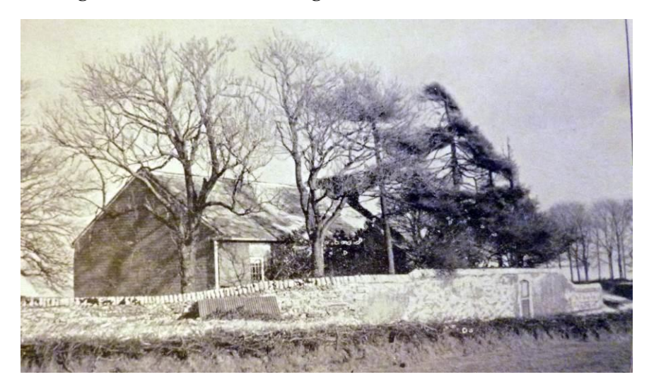
Fig.7: Setting in c1895, before housing development on the lane

The meeting house is on the south-west edge of Ulverston, a market town close to the south coast of Cumbria. Swarthmoor Hall, the seventeenth century home of Judge Fell is half a mile to the north-west. The meeting house, originally in a rural location, now has a partly suburban setting with early twentieth century houses along the road, but there is still a field to the north and the adjoining burial ground to the rear. There is now a photovoltaic array in the field (Fig.8). The forecourt to the meeting house is enclosed by high stone walls with triangular copings, ramped up along the front wall above a chamfered stone gateway with a boarded door. The forecourt is laid to grass with mature trees. There are gateways leading west to the burial ground and east into the separate walled yard in front of the Barn (former stable) which has lower enclosing walls and a stone mounting block (Fig.10).