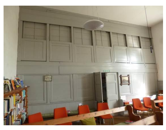
Statement of Significance

Swarthmoor Meeting House has exceptional heritage significance as a meeting house closely associated with George Fox who gave the site to local Friends in 1687/1688. The building incorporates an earlier house and barn, and retains many historic Quaker fittings. The building has an attractive setting on the edge of Ulverston, close to Swarthmoor Hall with an attached burial ground used since c1702.