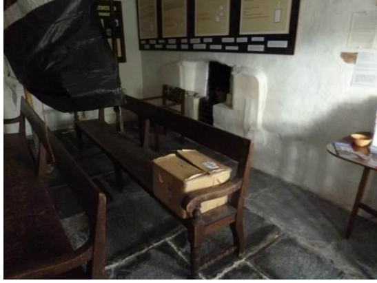
Fig.4: pine bench in meeting room