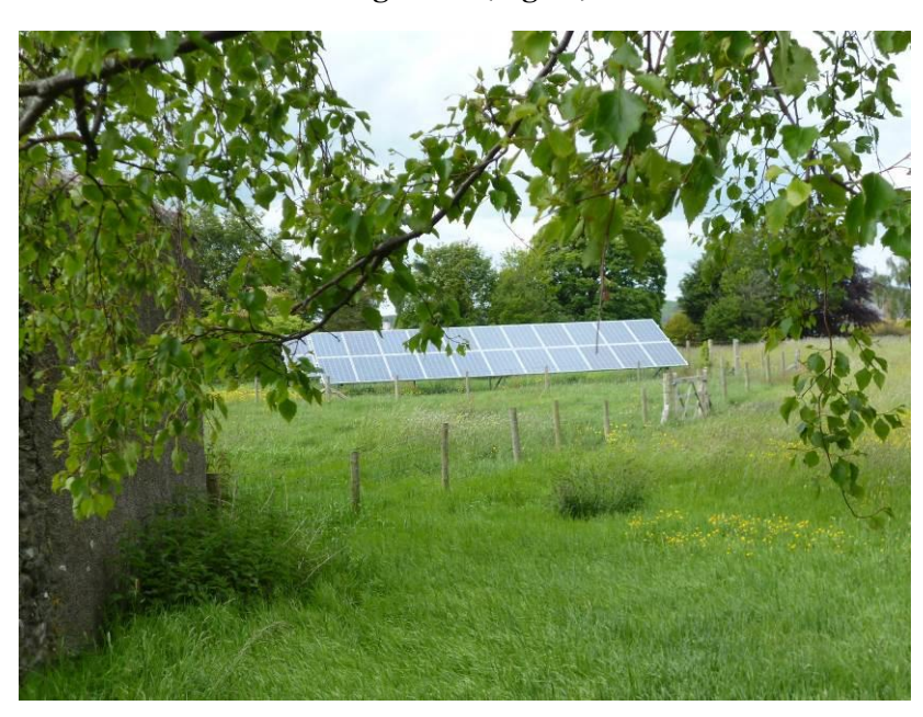
Fig.8: photovoltaic array in adjoining field

The meeting house is on the south-west edge of Ulverston, a market town close to the south coast of Cumbria. Swarthmoor Hall, the seventeenth century home of Judge Fell is half a mile to the north-west. The meeting house, originally in a rural location, now has a partly suburban setting with early twentieth century houses along the road, but there is still a field to the north and the adjoining burial ground to the rear. There is now a photovoltaic array in the field (Fig.8). The forecourt to the meeting house is enclosed by high stone walls with triangular copings, ramped up along the front wall above a chamfered stone gateway with a boarded door. The forecourt is laid to grass with mature trees. There are gateways leading west to the burial ground and east into the separate walled yard in front of the Barn (former stable) which has lower enclosing walls and a stone mounting block (Fig.10).